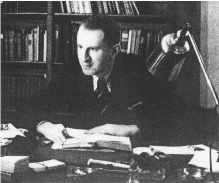
Marcuse, c. 1935