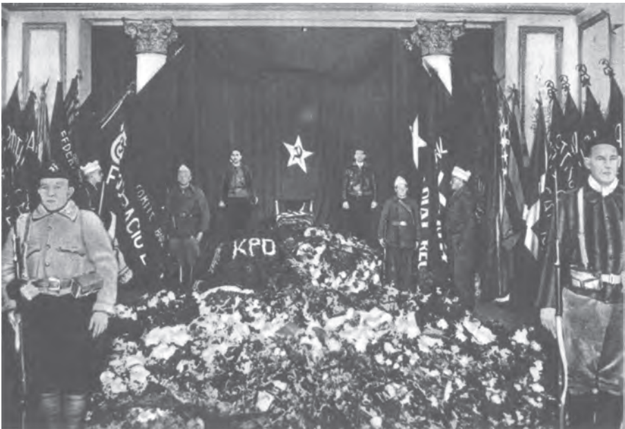
Honor Guard of the People's Army and International Brigades around the remains of Hans Beimler (Madrid, December 1936).