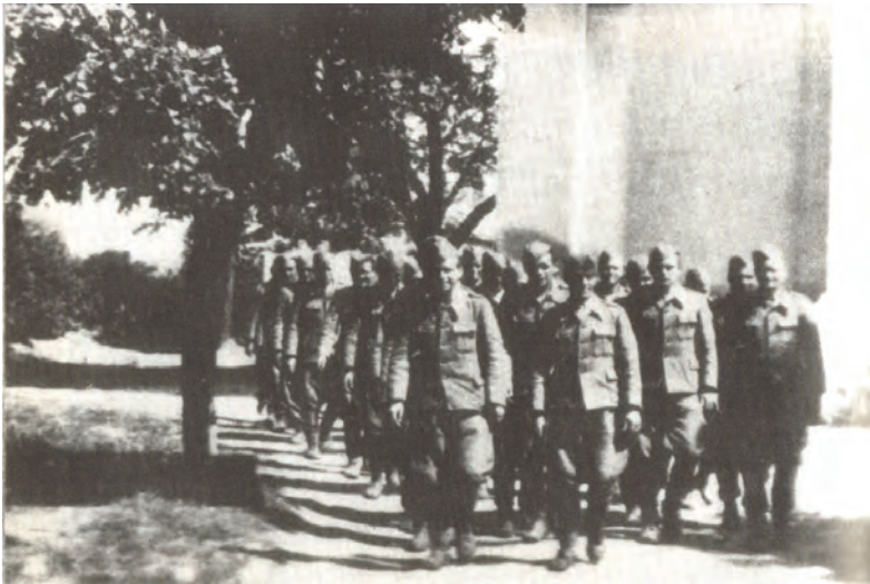
German partisans of the Yugoslav People's Liberation Army on the road from Semlin to Belgrade (February 1945).