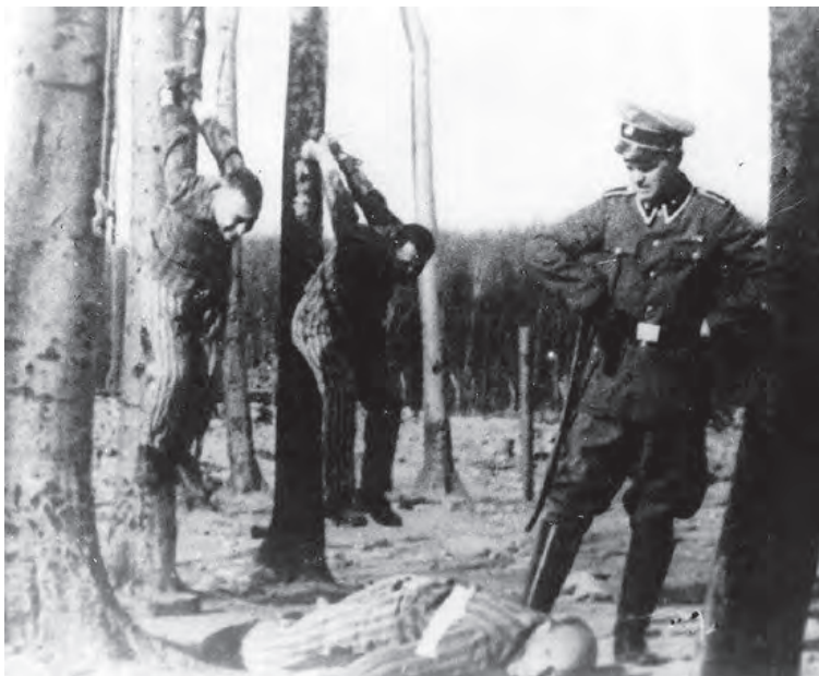
The punishment of political prisoners in Buchenwald by SS executioner Martin Sommer.