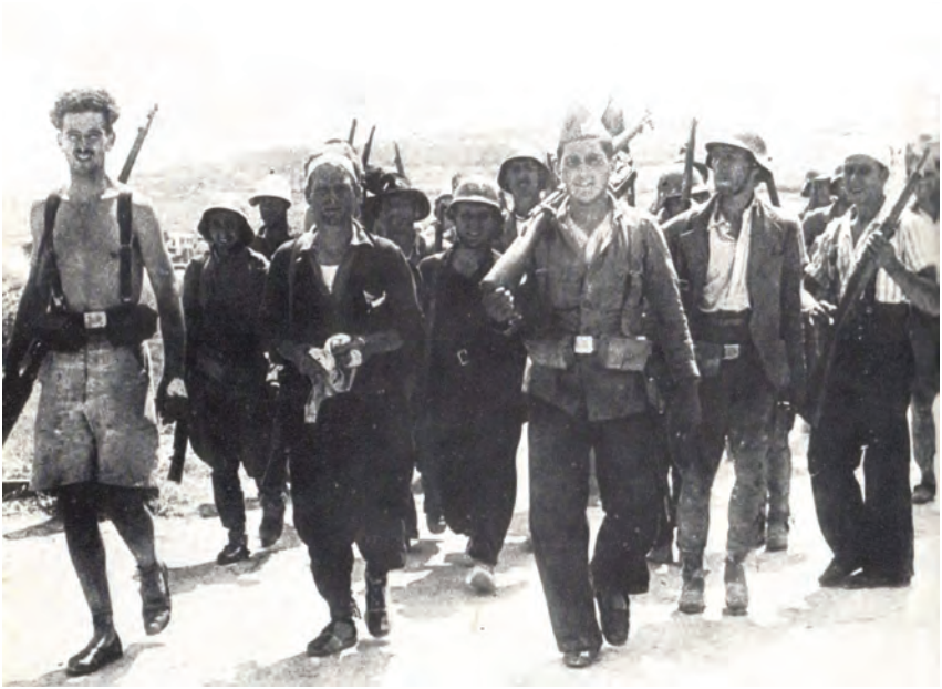
The first German volunteers of the “Thälmann” Centurion in the summer of 1936.