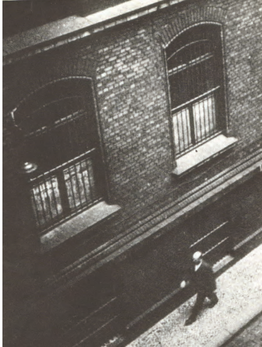
Ernst Thälmann, general secretary of the KPD, secretly photographed in Berlin-Moabit prison (1933).