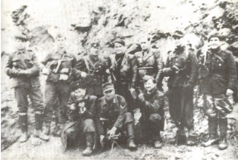
German and Slovak partisans during the great Slovak antifascist uprising of 1944.