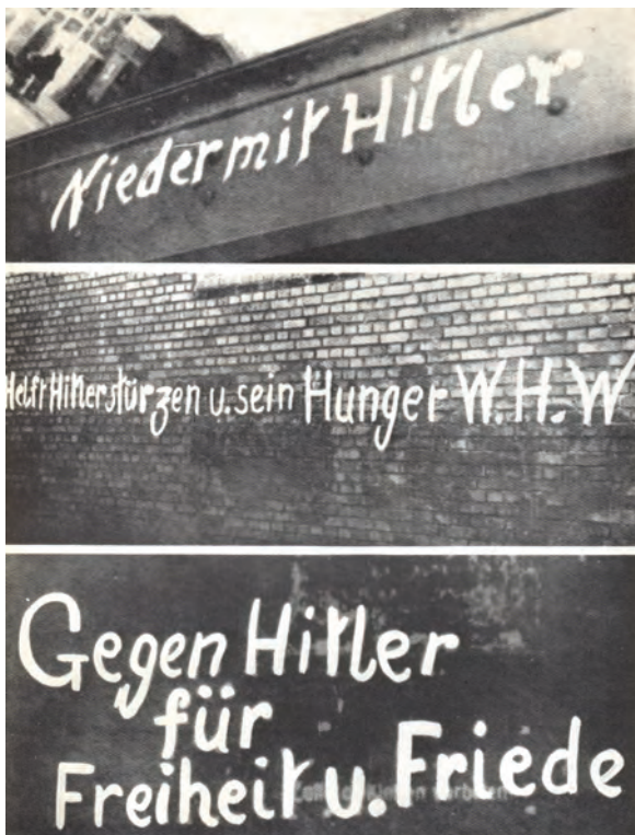
“Down with Hitler,” “Overthrow Hitler and his famine regime,” “Against Hitler, for freedom and peace,” slogans painted in various German cities in 1941 (photos taken by the Gestapo).