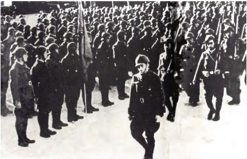
A few months later: the “Thälmann” battalion, the shock unit of Republican Spain.