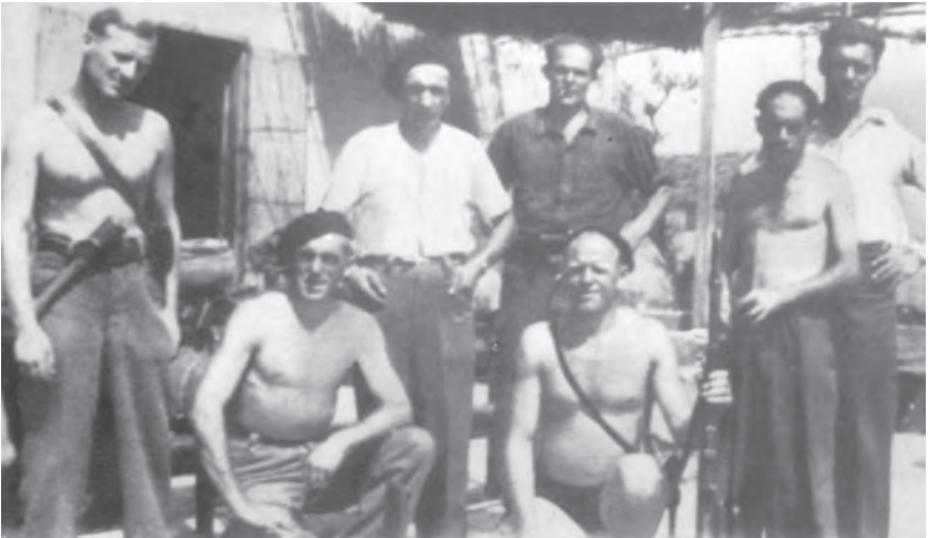
German and Austrian partisans of the 104 th Company of the 5 th FTP Battalion, Cévennes 1944.