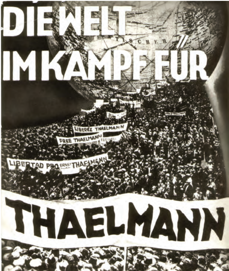
“The World in Combat for Thälmann,” photomontage on the cover of the Thälmann Committee brochure.