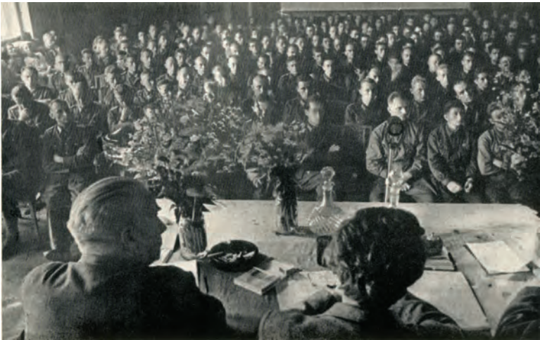
Constituent Conference of the National Committee for a Free Germany in Moscow, July 1943.