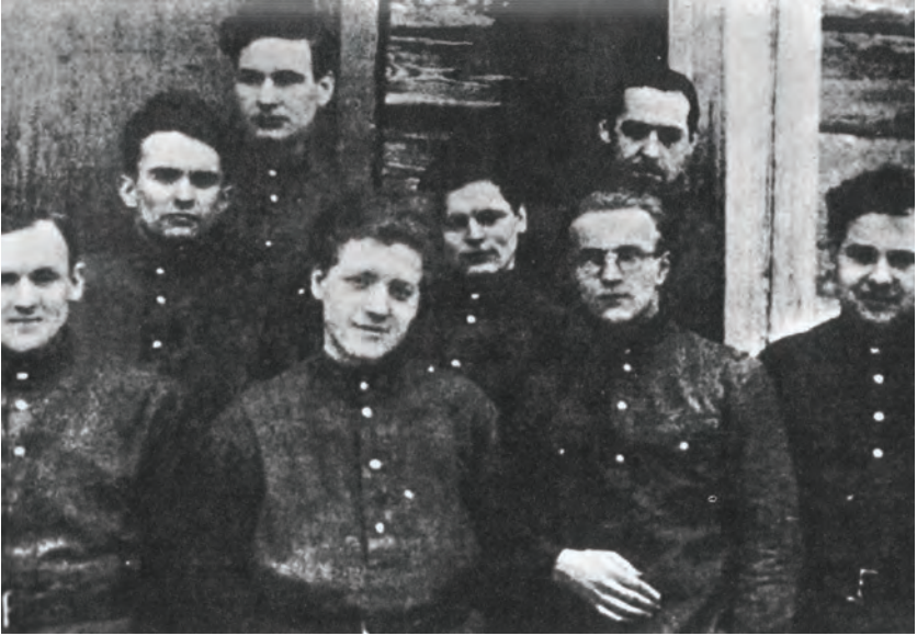
German and Austrian anti-fascists fighting in a unit of Soviet partisans in 1944.