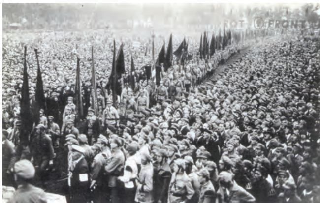
Annual rally of Berlin militiamen of the Roten Frontkämpferbund, the KPD's paramilitary organization (1926).