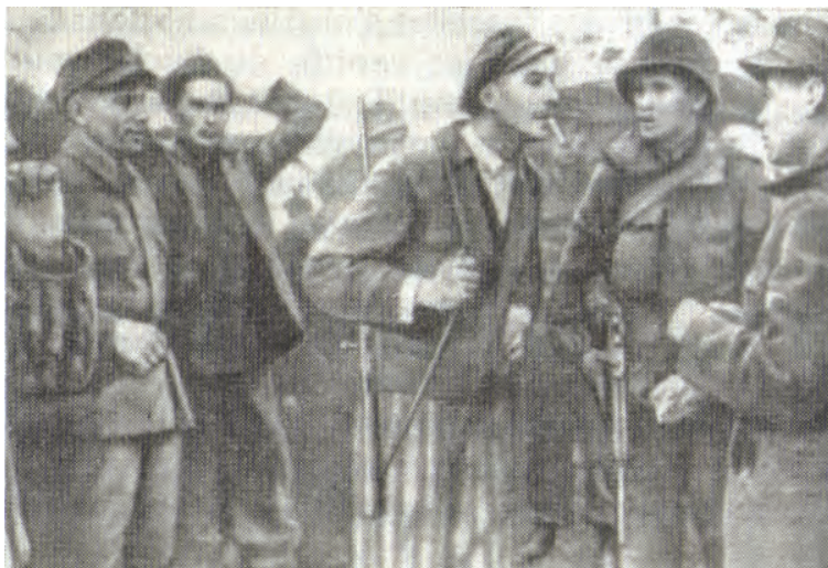
The Buchenwald insurgents (with American soldiers and SS prisoners) after the camp's self-liberation.