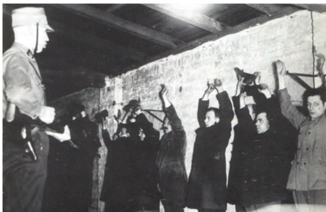
Communist militants arrested by the SA at the Columbia-Haus in Berlin (March 1933).