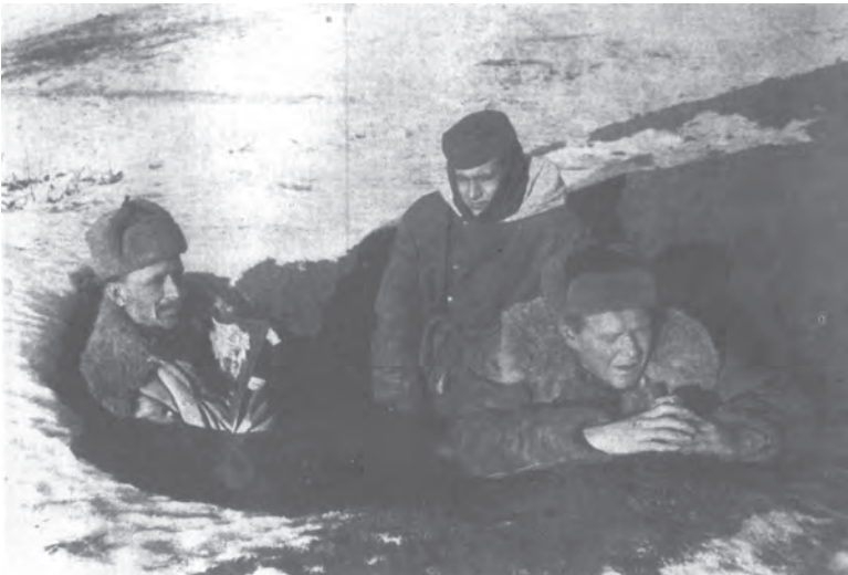
Walter Ulbricht and Erich Weinert, leaders of the KPD and the National Committee for a Free Germany, call on the Wehrmacht soldiers surrounded in Stalingrad to lay down their arms.