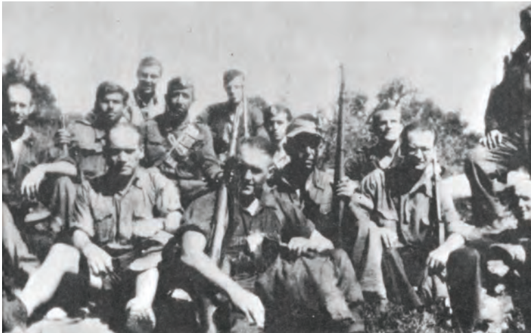
German and Greek partisans of the National Liberation Army of Greece, August 1944.