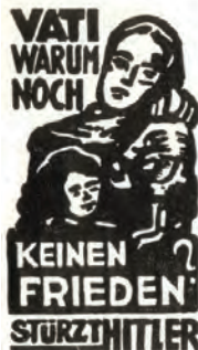
Leaflet of the KPD's Saefkow organization (Berlin, 1944).