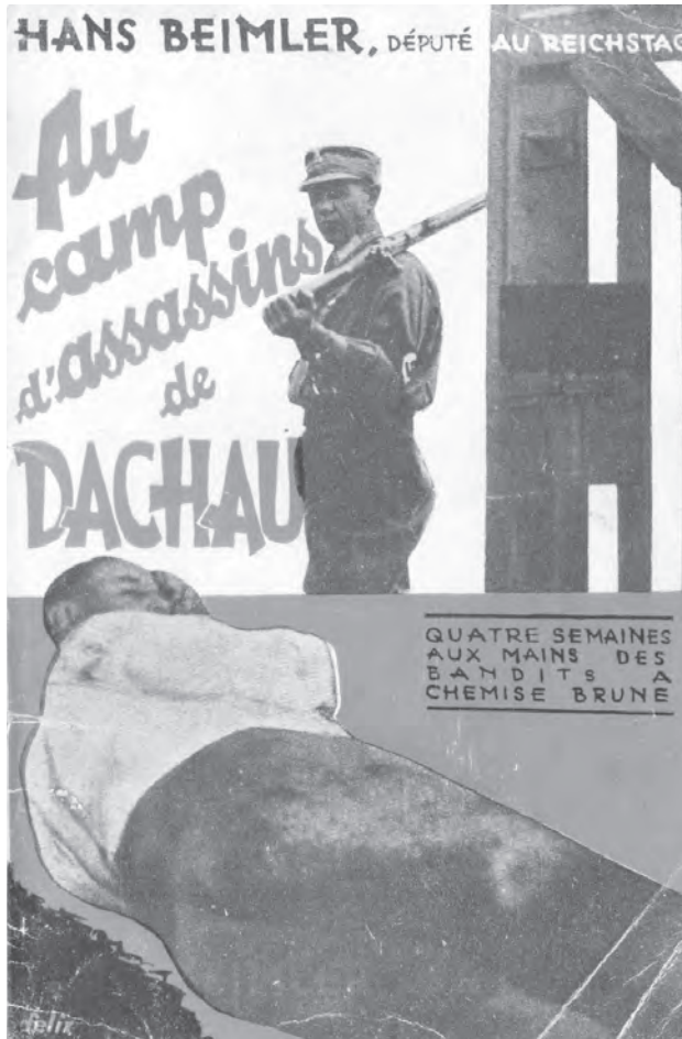
Brochure published in Paris in 1933 by Hans Beimler, KPD deputy in Bavaria, following his escape from Dachau.