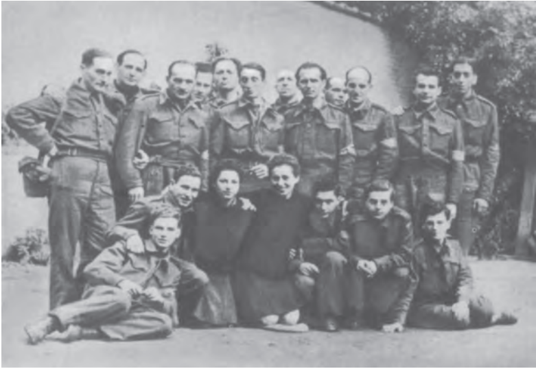
German and Austrian anti-fascists who fought in the Belgian Partisan Army, Brussels 1944.