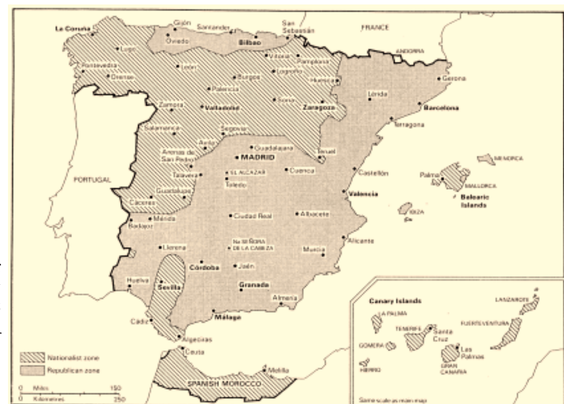
Figure 1 Division of Spain into Republican and rebel (Nationalist) zones, 22 July 1936