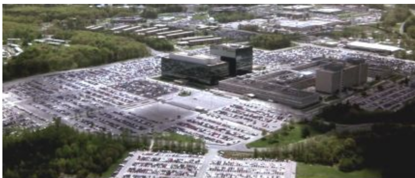
[Above] NSA Headquarters, Fort Meade from Enemy of the State.

article in the Baltimore Sun illustrates that they might yet jump into the game. Jerry Bruckheimer told the paper that the NSA have 'realized that to turn away Hollywood makes you an even bigger bad guy.' The article goes on to explain that the original screenplay for Enemy of the State (1998) depicted the NSA as employing brutal tactics in hunting down Will Smith, but, after NSA cooperated on the production and offered up an ex-employee as a consultant, 'Bruckheimer agreed to pin the wrongdoings on a bad-apple NSA official, and not the agency.' Bruckheimer predicted, 'I think the NSA people will be pleased. They certainly won't come out as bad as they could have. NSA's not the villain.' [cxxx] Straight from the CIA/ DOD play-book.