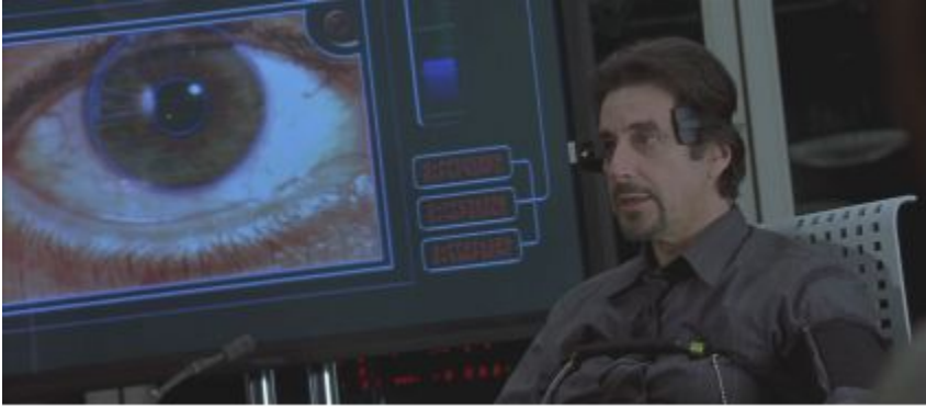
[Above] Al Pacino plugged into a lie detector, The Recruit .