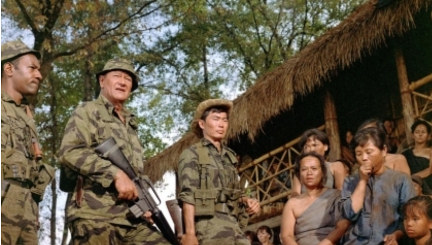
[Above] Fresh from winning World War II, John Wayne turns his sights on Vietnam.