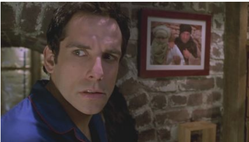
[Above] Ben Stiller sees intimidating images of his fiancé’s father in Meet the Parents . Originally, the images were going to be CIA torture manuals.