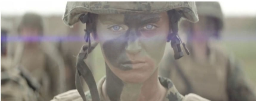
[Above] Katy Perry joins the Marine Corps for Part of Me.

not a military issue per se, we think that it's way too heavy-handed for Chin to torture Sang Min by beating him with an ashtray, but, more to the point, we can't go along with McGarrett turning a blind eye to it.' In the finished scene, Chin only hits Sang Min once and apologises as soon as McGarrett walks in and sees him. [xxxvii] These changes helped shape not just the pilot episode but the central character, tone and 'moral compass' of the rebooted series, which is now in its 7 th season.