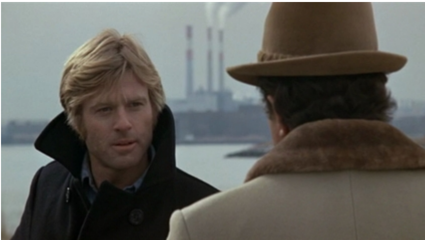
(Above) Robert Redford's CIA analyst listens to a realist rationalisation for CIA activity.

It had the cadences of what real CIA people do, and what real CIA people are like... Even some of the scenes in the movie—a lot of the action is set in a CIA cover facility that several years later I found myself in a place that looked almost exactly like that movie. I don't know how they did it but they managed to replicate what a real CIA cover facility was like. [lxxxiv]