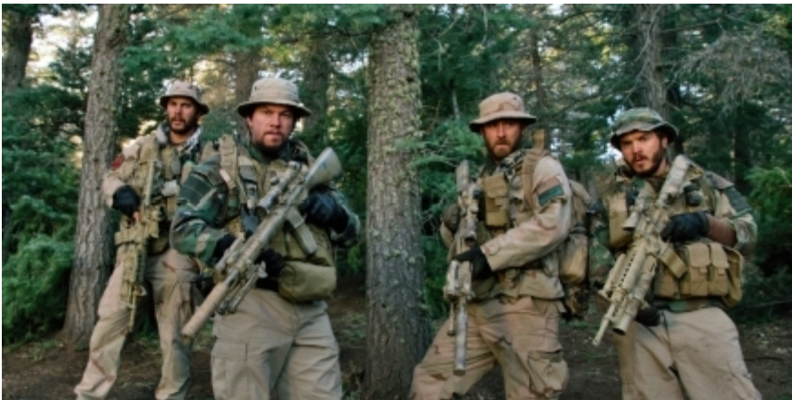
[Above] Mark Wahlberg and the other SEALs in Lone Survivor .

The Pentagon knowingly altered the critical scene in Lone Survivor , even though it was based on the account of the only survivor of the real events, because it did not suit their PR agenda and desired public image. This fact alone puts the lie to the Pentagon's claims that their involvement in Hollywood is motivated by concern for authenticity and technical accuracy, as well as revealing some of the true reasons for that involvement.