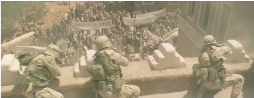
(Above) The Marine Corps open fire on a crowd in Rules of Engagement.

Rules of Engagement was denounced by the American-Arab Anti-Discrimination Committee (ADC) as ‘probably the most vicious anti-Arab racist film ever made by a major Hollywood studio;’ the government of Yemen condemned the film as a ‘barbaric and racist attack against Arabs and Yemenis,’ urging all Arab states to boycott it and its studio. [cclix] CAIR wrote to Secretary of Defense William Cohen, saying that the film ‘seems to justify the killing of Muslim men, women and even children ... it also offers a very negative image of Muslims and Islamic beliefs.’ [cclx] Naturally, with such glowing testimony, the film had received unequivocal support from the Pentagon, including the provision of the aircraft carrier USS Tarawa , as well as helicopters and personnel. [cclxi]