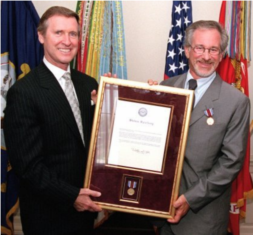
[Above] Director Steven Spielberg accepting an award from Defense Secretary, William Cohen.

Munich (2005) dramatized Israel's response to the Palestinian terror attacks at the 1972 Olympics. Although the media emphasised the film's even-handedness, the filmmaker Steven Spielberg said explicitly that he agreed with Israel's lethal retaliation. [ ccclxv ] Spielberg's sympathies do indeed come across in the film—the most celebrated 'anti-war' [ ccclxvi ] scene is actually a two-and-a-half minute exchange between an Arab and an Israeli which, close textual analysis reveals, merely points out that the whole Palestinian struggle is both futile and immoral. The film had no government support and, ironically, it was the filmmaker, Spielberg who—although unreported in the usual Western news outlets—provided a million dollars' worth of aid to Israel during its 2006 invasion of Lebanon. [ ccclxvii ]