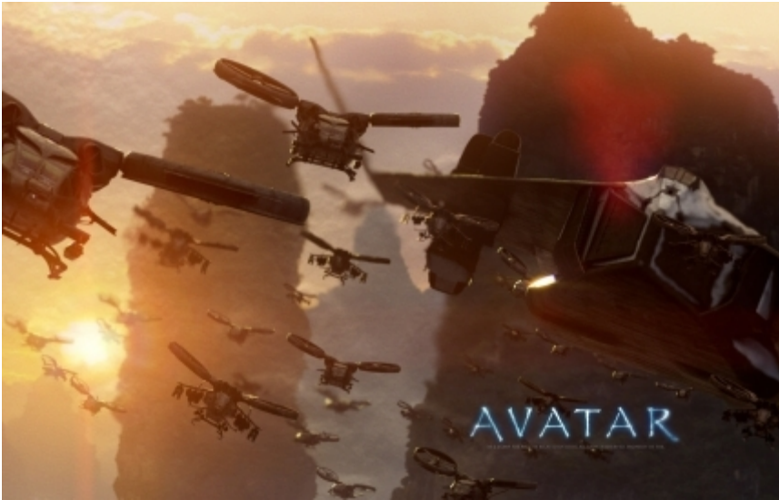
[Above] CGI-generated military planes in Avatar

Avatar seemed to do the unthinkable. It is, undeniably, a film that is opposed to war, imperialism and environmental destruction. Not only that but it was made right in the belly of the corporate Hollywood beast and, even more remarkably, the industry supported it at full throttle and the result was the highest grossing film of all time.