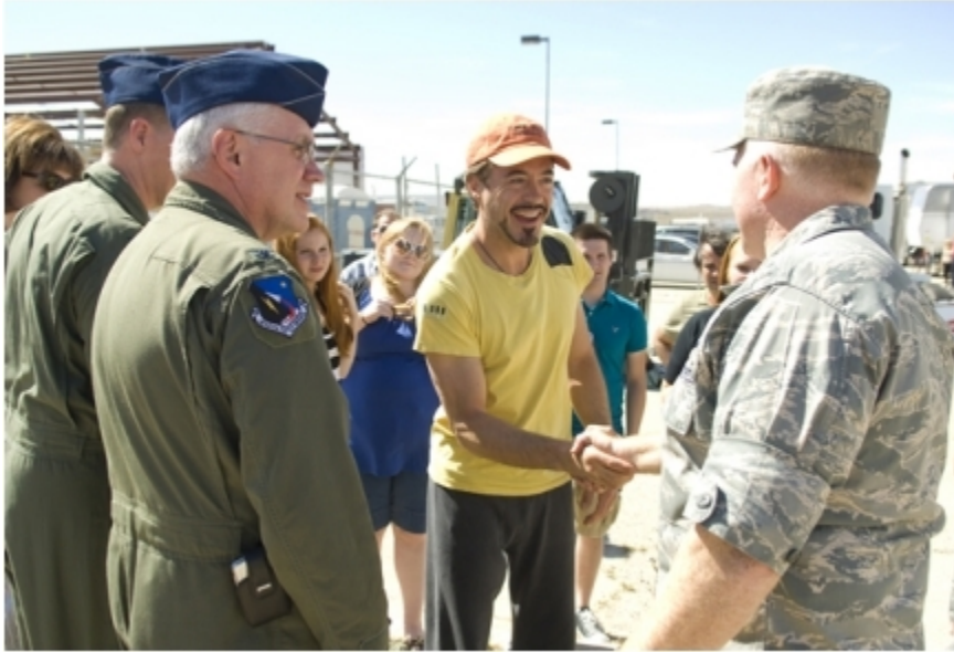
[Above] Robert Downey Jr. on set at Edwards Air Force Base for Iron Man 2 .

Just as with the original, Iron Man 2 received full cooperation from the Pentagon. Primarily, this came from the Air Force but the Marine Corps also reviewed the script, provided extras, and technical advisors were on set during filming and Edwards AFB was again used as a major filming location. The DOD even had input on the visual design of the War Machine armoured suit as their database records that, 'the Air Force assisted in designing the war machine markings.' [ccxxxii] Officers from Pentagon were also present for shooting the drone scene—the final battle where all of these elements coincide in one happy mess with lots of broken glass. The film was screened at Camp Pendleton prior to its full release, which the Marine Corps saw as a big success, 'bringing 1600 personnel to a 1350 chaired theatre.' [ccxxxiii]