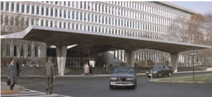
[Above] Harrison Ford walking into CIA headquarters, 1992.

After fostering a friendship with spy author Tom Clancy, the CIA gave permission for Patriot Games (1992) and then Mission: Impossible (1996) to become the first movies to film at Langley headquarters since the 1970s. A trickle of other celebrities began to visit Langley. They tried to develop a series akin to The FBI , this time based on CIA operations files, though this fell apart when the Agency insisted on editorial control.