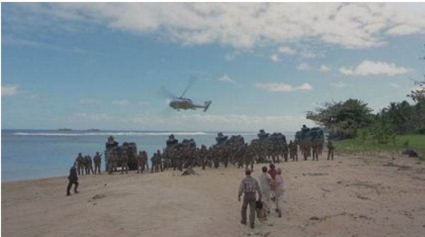
[Above] The DOD’s ‘nice military rescue’ at the end of Jurassic Park III.