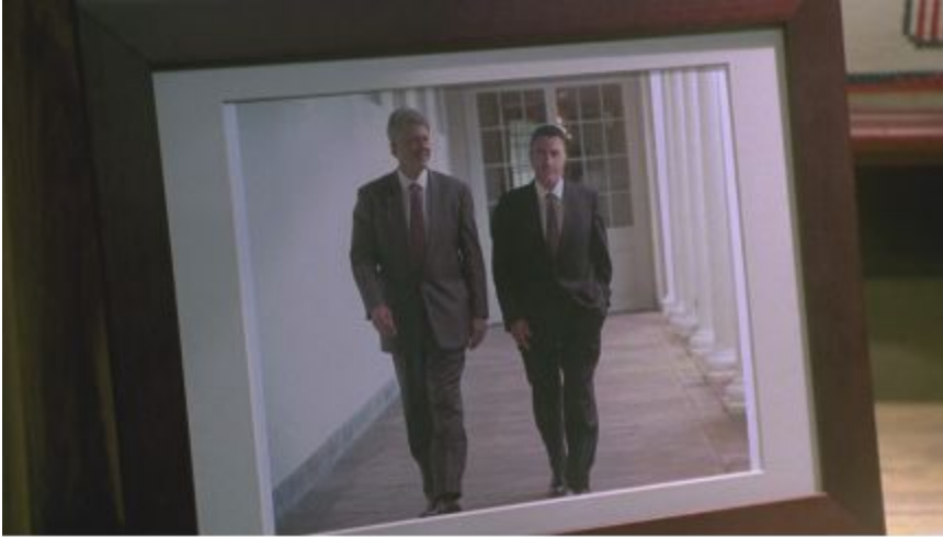
[Above] Robert De Niro with President Bill Clinton in Meet the Parents .