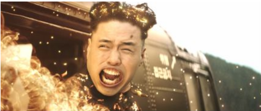
[Above] Kim Jong Un is finally assassinated in The Interview .

However, the files do provide further details on the decisions being made within Sony and on their liaisons with other organisations during the production and in the run-up to the film's release. Of particular concern was the ending, where a tank fires a shell at Kim's helicopter and we see, in slow motion, with Katy Perry's Firework on the soundtrack, the shell strike and detonate, making Kim's head set on fire and then explode. After top-level discussions at Sony Pictures, including with chairman of the Sony parent corporation Kazuo Hirai, this scene was softened and made less gory. Hirai was concerned that the film, and the ending especially, would enrage Japan's volatile neighbour.