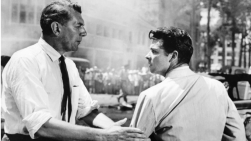
[Above] Fowler (Michael Redgrave, left) confronts Pyle (Audie Murphy, right) after the car bombing in Saigon.