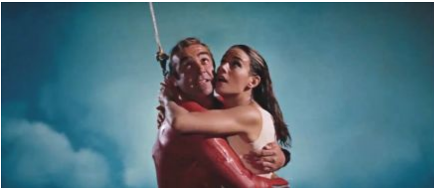
[Above] Bond and Domino rescued by a CIA front company.