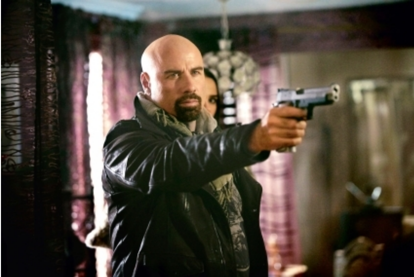
(Above) John Travolta, head shaved, with a large product placed gun in From Paris With Love .

Other times, the investors in movies are not large corporations but other large governments. Beijing has become a force to be reckoned with, as it has hundreds of millions of dollars invested in the main Hollywood companies, meaning that challenging films like Seven Years in Tibet and Kundun are no longer possible. While writing and casting Doctor Strange (2016), Marvel changed the character of The Ancient One from a Tibetan man to a Celtic woman, and cast British actress Tilda Swinton in the part, in an effort to avoid politicising the Tibetan issue. [ccclxxix] During the remake of Red Dawn (2012), Beijing received a leaked script and complained. The script had China as the principle villain, invading the United States just as the Soviet Union had in the original 1984 film. The producers consequently spent a million dollars re-editing the movie to make the invaders North Korea. The effect? An already reactionary premise became ever more hysterical.