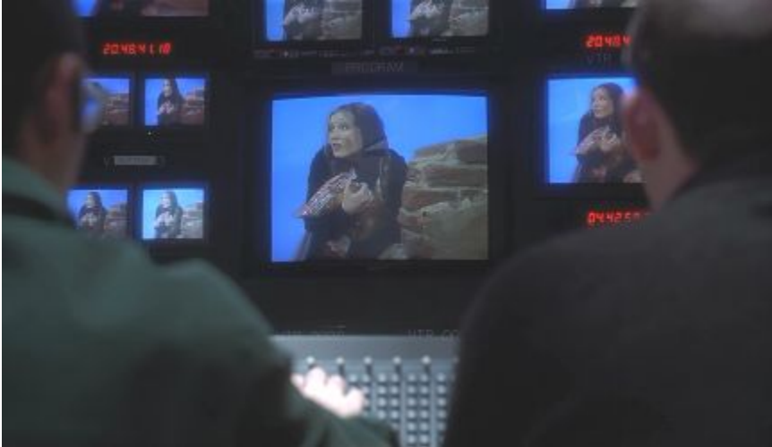
[Above] A humanitarian war is artificially constructed on television in Wag the Dog .

Schumann (Woody Harrelson). This is successful, and the potential child molestor is re-elected president. However, movie producer Motss is so driven by his desire to tell amazing stories that he demands the right to tell people what he has done, resulting in him being killed by unseen government agents. The film ends with a newscast suggesting that a real war might be breaking out in Albania.