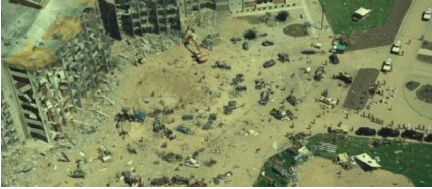
[Above] The aftermath of a suicide bomb, The Kingdom