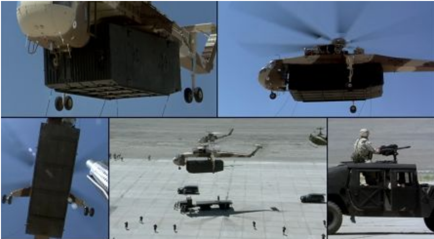
[Above] Five-way split-screen showing off military hardware in Hulk .

Such a recommendation is reminiscent of the DOD's farcical request that the Independence Day (1996) filmmakers eliminate 'any government connection' to Roswell and Area 51 and instead have a 'grass roots civilian group... protecting the alien ship on an abandoned base.' [ccxxii]