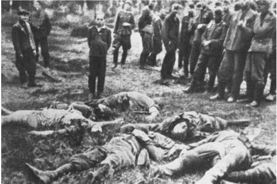
A boy forced to pose with the corpses of his family before his execution by the Wehrmacht, Zborov, Ukraine, 1941.

All in all, a minimum of 20 million Soviet civilians were exterminated by the Nazis, but some Russian scholars estimate that the true number is at least <u>double that.</u>