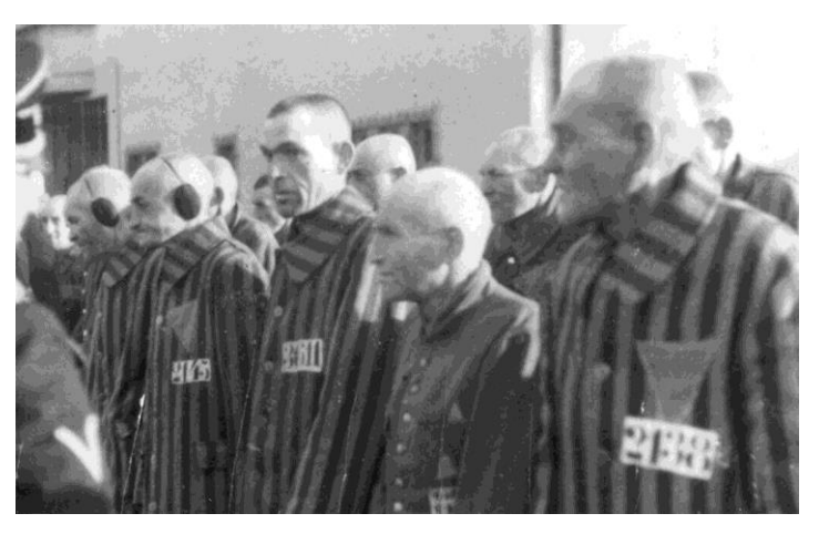
Slaves at a Continental rubber factory.

The Nazis needed more than just food to conquer the world. They also needed weapons and equipment. For this, Germany mustered its world-famous industrial might. The infamous concentration camps contained massive factory and labor complexes where millions of slaves were worked to death, building the weapons and equipment the Wehrmacht used to subjugate them. Given the magnitude of the contracts, very few German corporations kept their hands clean, and even the dirtiest kept all the blood money after the war.