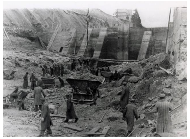
Slaves building a power plant for Steyr-Daimler-Puch at Mauthausen.