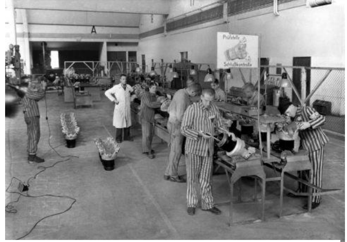
Slaves at a BMW factory in Dachau.