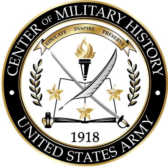
The center's logo.

After Halder surrendered to the US Army, the United States refused to try him at Nuremberg. Instead, he faced only a minor trial for "aiding the Nazi regime" in a German court. He denied any knowledge of the crimes which bore his literal signature and was found not guilty. After the war, he lived a comfortable life as an author, commentator, and "historical consultant" for the US Army <u>Center of Military History</u>.