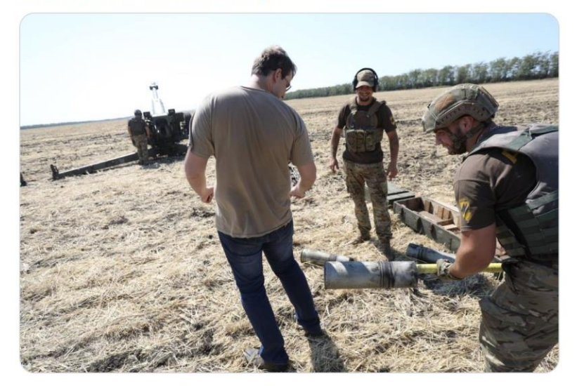
3:13 AM · May 14, 2019 · Twitter Web Client

You can only be guessing what's happening over there between me and @Polk_Azov gunmen. Spoiler: Consecrating me as an artillerist, of course. #Donbas #Azov #artillery